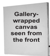
Smooth edge may be painted