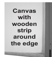
Corner detail: Wooden strip around smooth edge. The wooden strip may be painted.