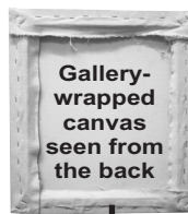
Canvas stapled on the back of the canvas. Hanging wire is attached to the back.

Painted or unpainted wooden strip around the edge of the work; gallery-wrapped canvas, or neatly presented work in a simple yet complimentary frame with or without a liner. Gallery wrapping is where the canvas is stretched and stapled on the back of the stretcher. The edge of the canvas may be painted or covered with a painted or unpainted wooden strip depending on what suits the work.